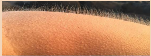
Very cold skin