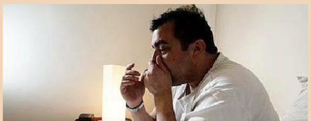
Feeling a lot worse

If you have COVID-19 and start to feel worse, including showing the signs above, seek immediate medical help from NHS 111 (call 111 or visit https://111.wales.nhs.uk/coronavirus(2019ncov) )